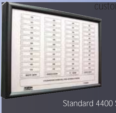
Standard 4400 Series Panel

Used with the Cornell Series 4000 Visual Call System, permits remote monitoring of individual rooms/zones. The A-4400 Series annunciator panels allow for displaying from 8 to 48 zones, which can be custom labeled via software.