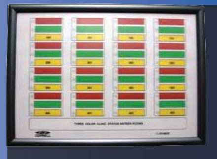
Customized 4400 Series Panel