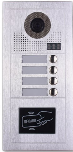
MT-804R—Outdoor Gate Station