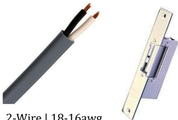
2-Wire | 18-16awg (Stranded, Unshielded) 12v DC Strikes Available